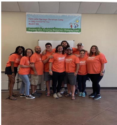
Spring Retreat 2023

Join us for Sunday night Supper at 6:00 p.m. Wednesday devotional at 8:00 p.m.