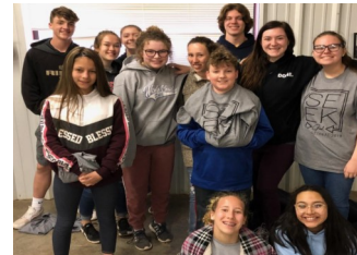
2019 Spring Retreat @ Camp Lujo

Zenith and Cornerstone: Registration for OC camps is now open at CampOC.org . Zenith is for high school students on June 16-21, and Cornerstone is for middle school students on June 23-27. Register before the end of March for the cheapest price for camp at $235 with the coupon code LOVECAMPOC.