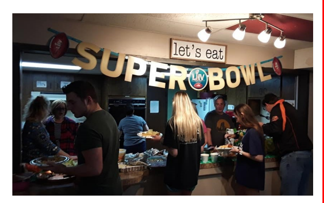
A great time was had by all! See you tonight at 6:00 for our free Sunday Supper!