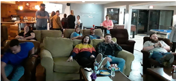
2022 Super Bowl Party

Our Wednesday night devotional will be at 8:00 p.m. at MAC.